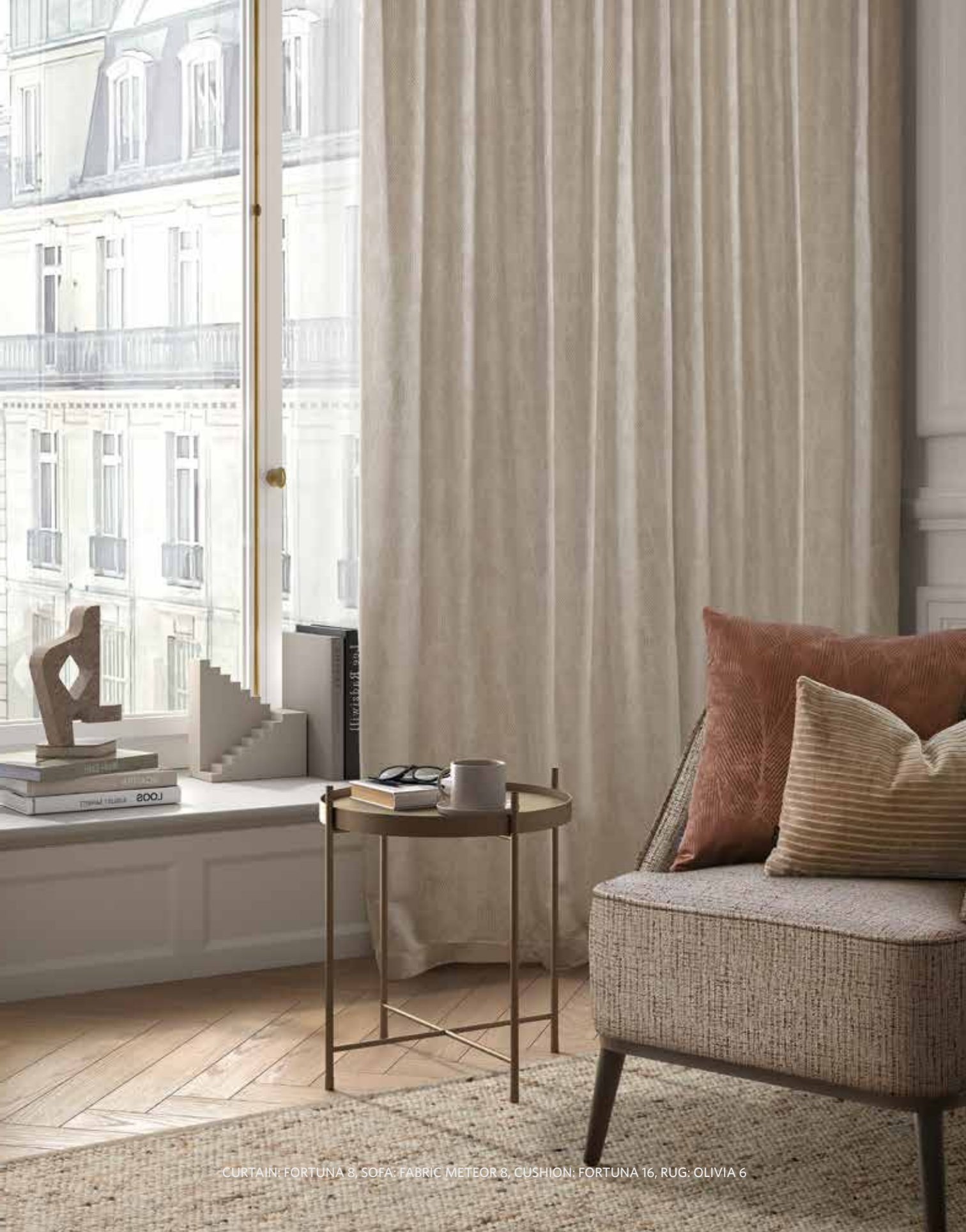
CURTAIN: FORTUNA 8, SOFA: FABRIC METEOR 8, CUSHION: FORTUNA 16, RUG: OLIVIA 6