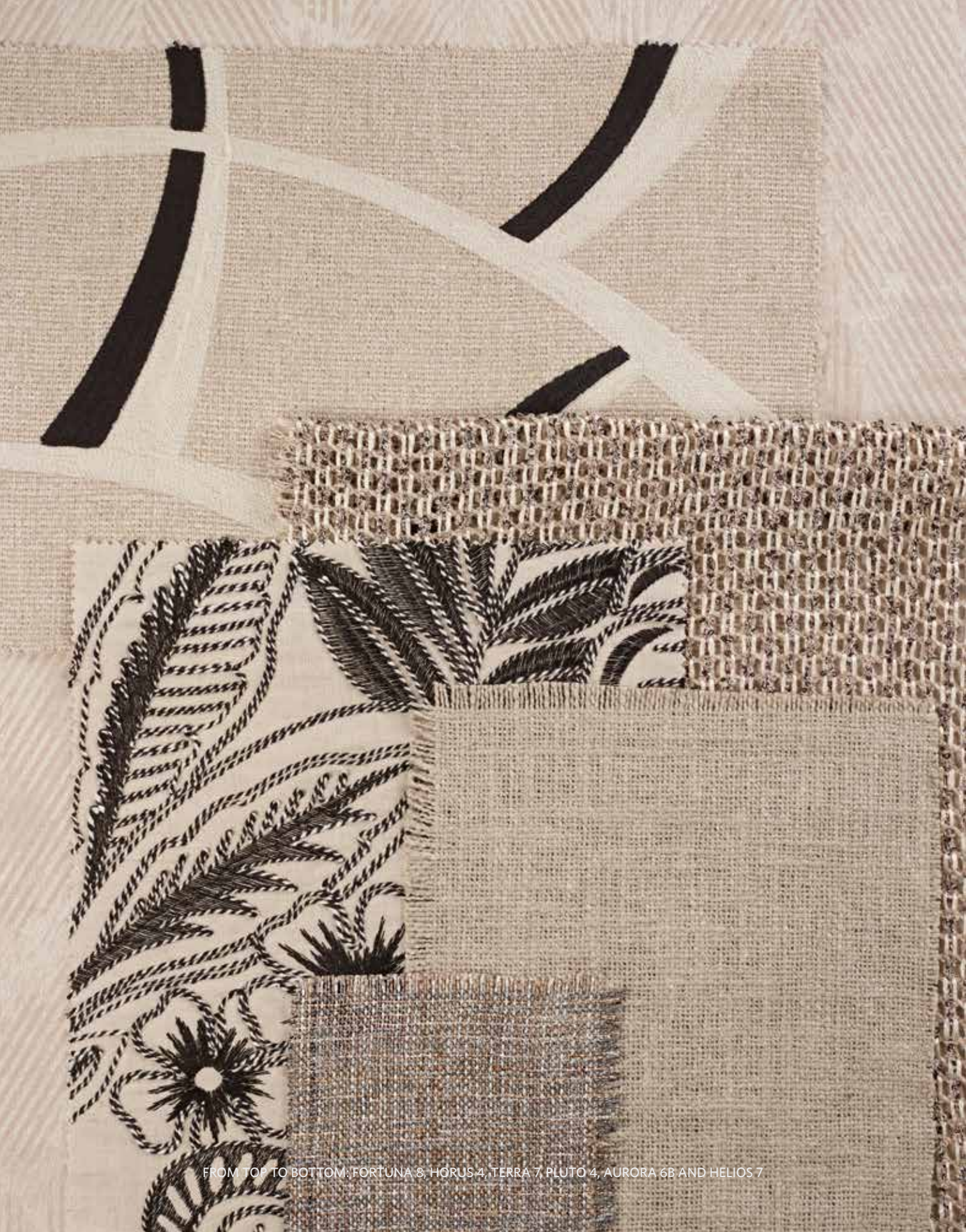
FROM TOP TO BOTTOM: FORTUNA 8, HORUS 4, TERRA 7, PLUTO 4, AURORA 6B AND HELIOS 7