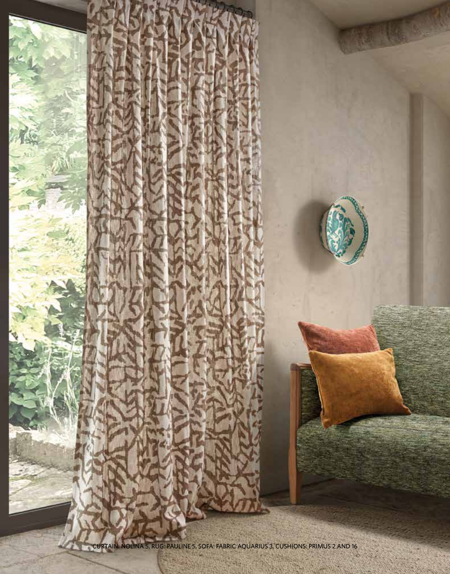
CURTAIN: NOLINA 5, RUG: PAULINE 5, SOFA: FABRIC AQUARIUS 3, CUSHIONS: PRIMUS 2 AND 16