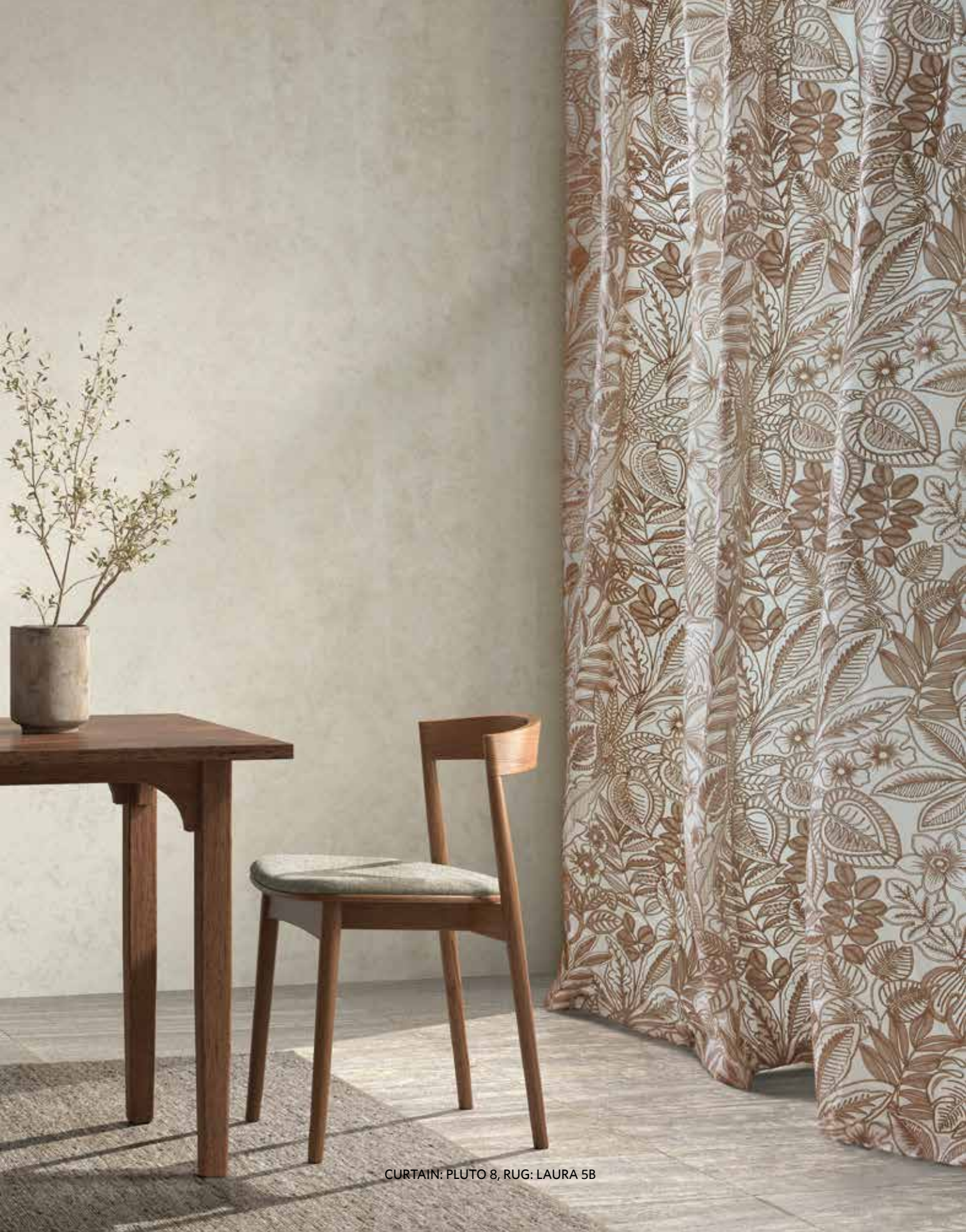
CURTAIN: PLUTO 8, RUG: LAURA 5B