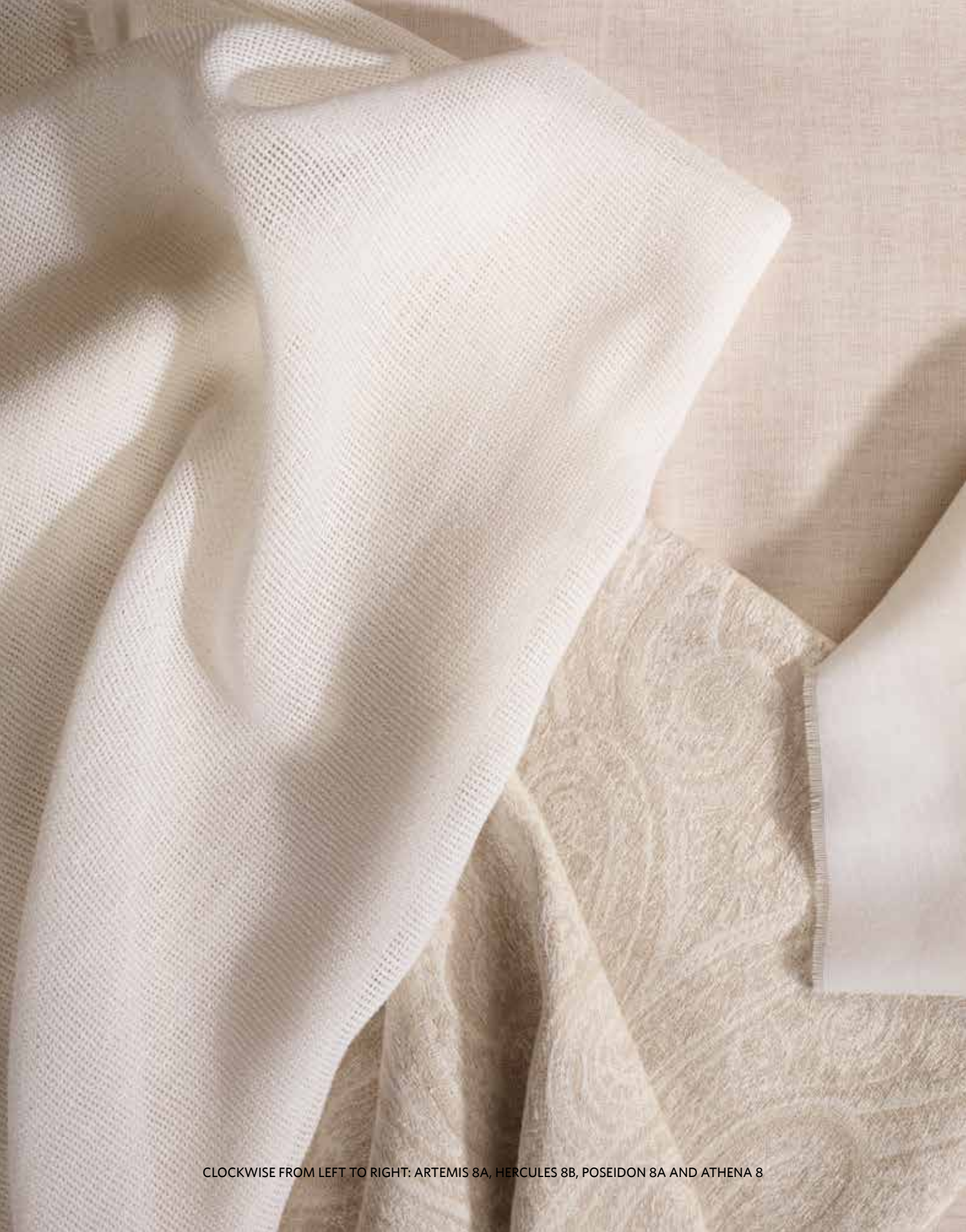
CLOCKWISE FROM LEFT TO RIGHT: ARTEMIS 8A, HERCULES 8B, POSEIDON 8A AND ATHENA 8