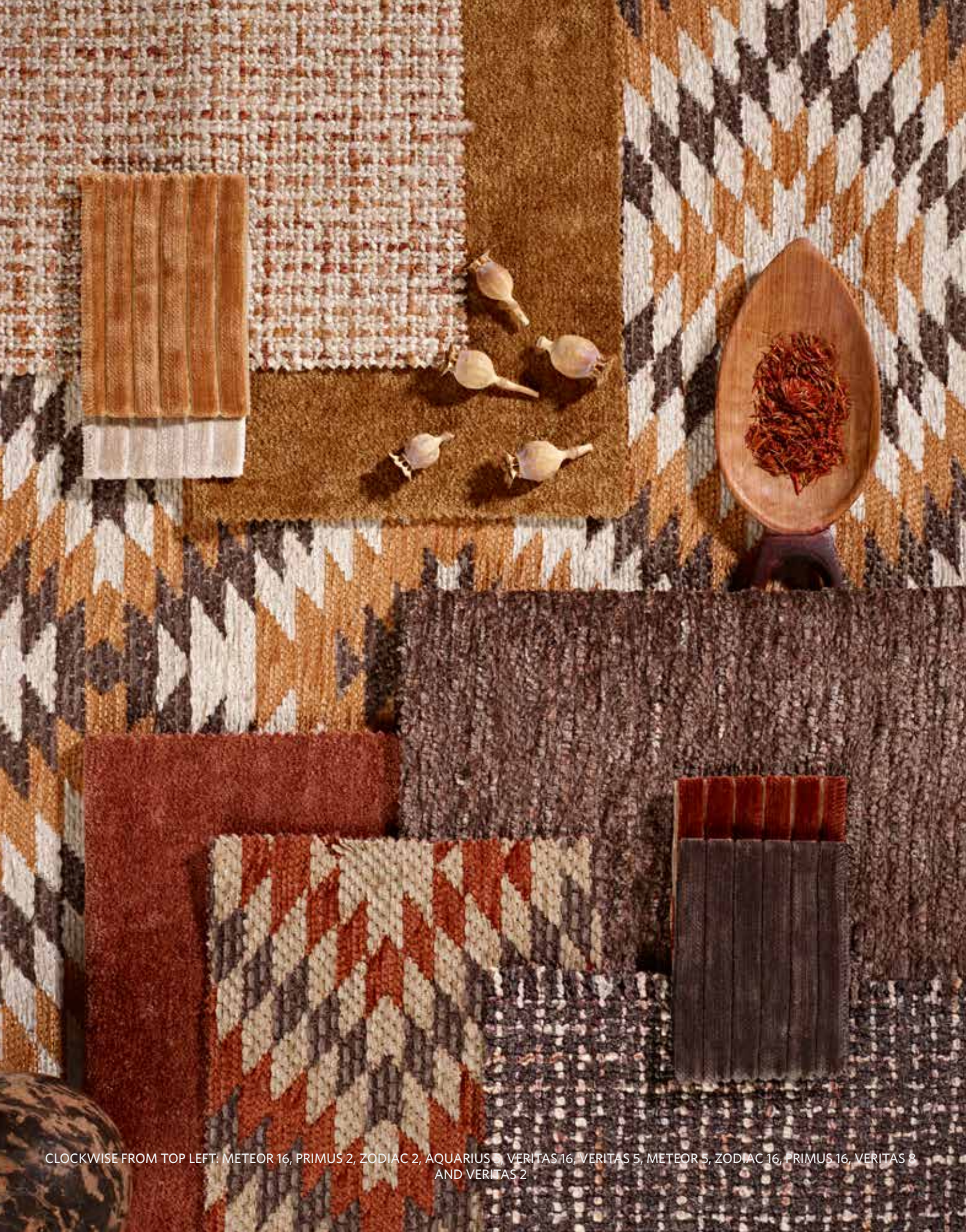
CLOCKWISE FROM TOP LEFT: METEOR 16, PRIMUS 2, ZODIAC 2, AQUARIUS 5, VERITAS 16, VERITAS 5, METEOR 5, ZODIAC 16, PRIMUS 16, VERITAS 8 AND VERITAS 2