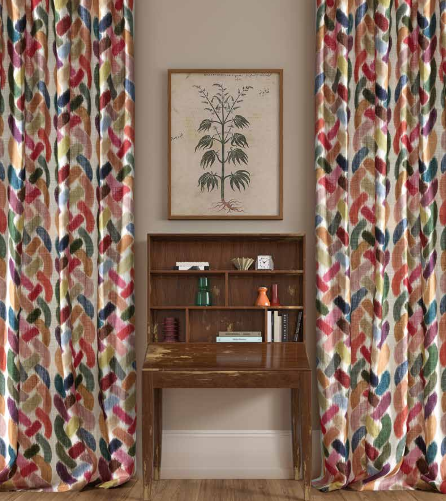
CURTAINS: WASABI MULTI, RUG: LAURA 8