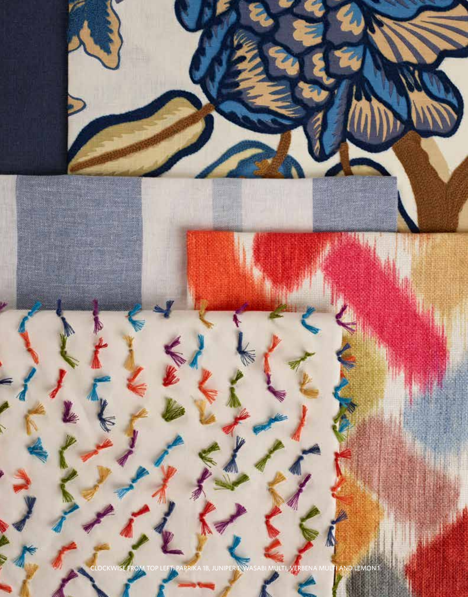
CLOCKWISE FROM TOP LEFT: PAPIRIKA 1B, JUNIPER 1, WASABI MULTI, VERBENA MULTI AND LEMON 1