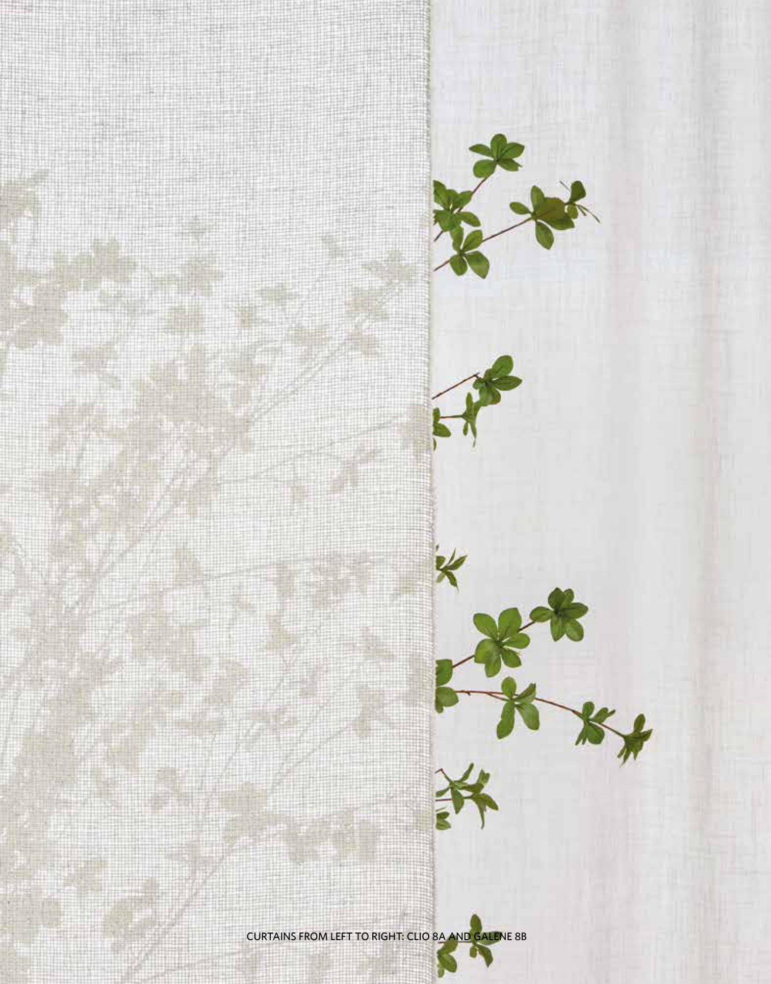
CURTAINS FROM LEFT TO RIGHT: CLIO 8A AND GALENE 8B