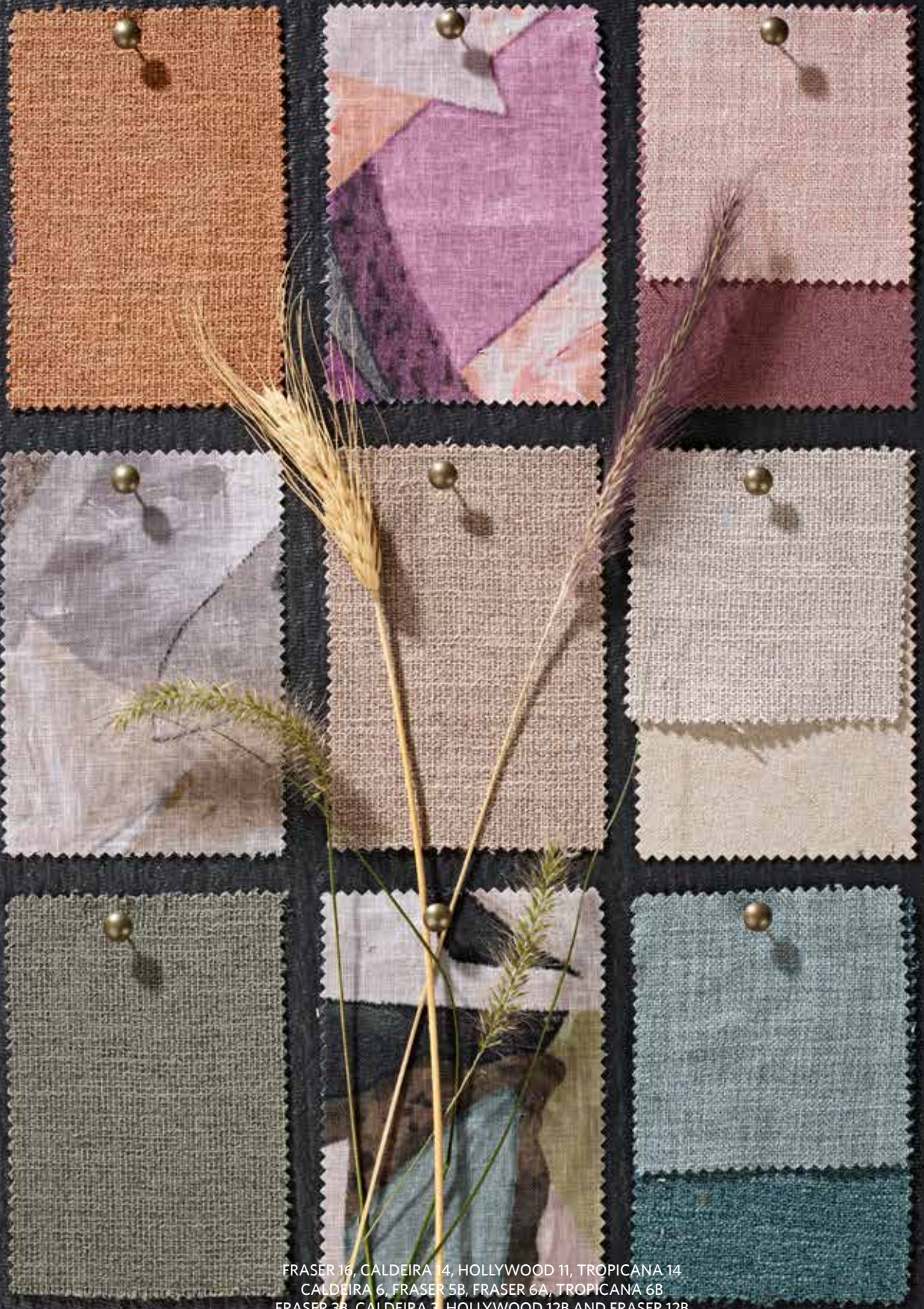
FRASER 16, CALDEIRA 14, HOLLYWOOD 11, TROPICANA 14 CALDEIRA 6, FRASER 5B, FRASER 6A, TROPICANA 6B FRASER 3B, CALDEIRA 3, HOLLYWOOD 12B AND FRASER 12B