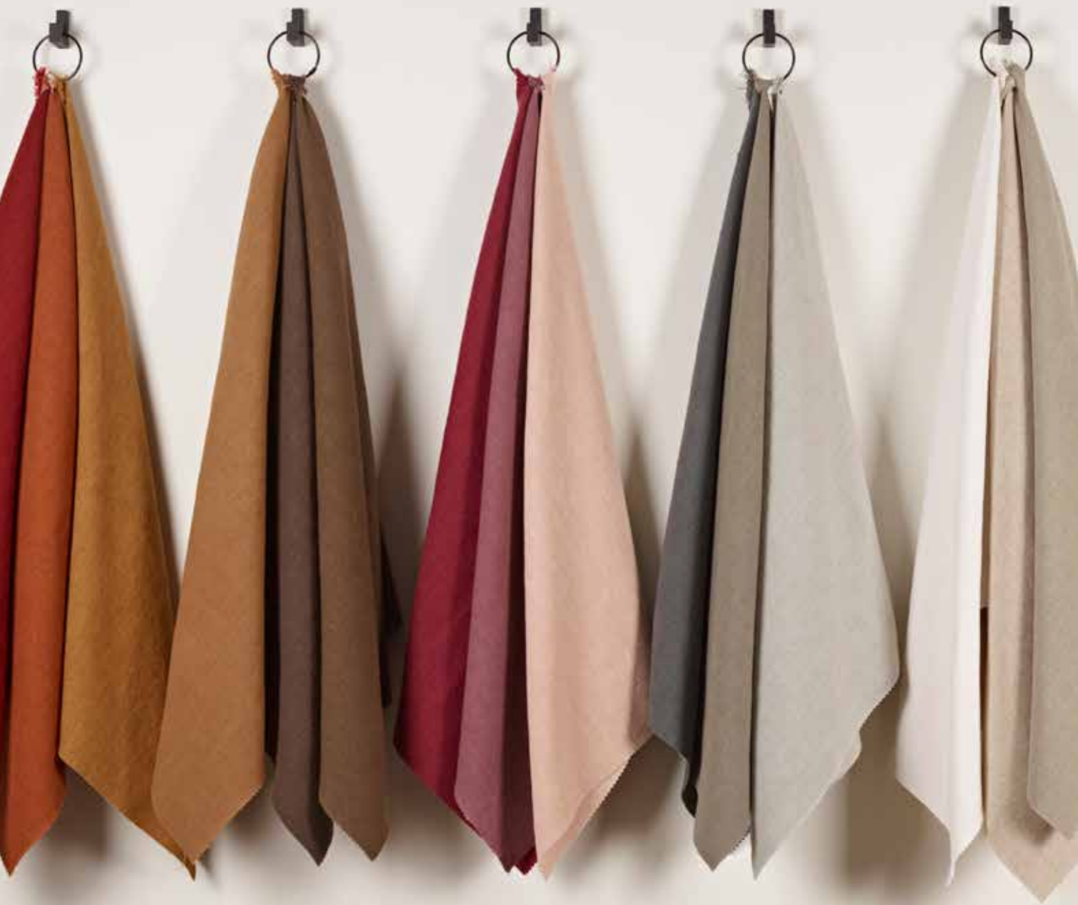
FROM LEFT TO RIGHT: PAPRIKA 0, 16, 2A, 2B, 5D, 5C, 13, 14, 11, 7C, 7B, 7A, 8A, 8C AND 5A