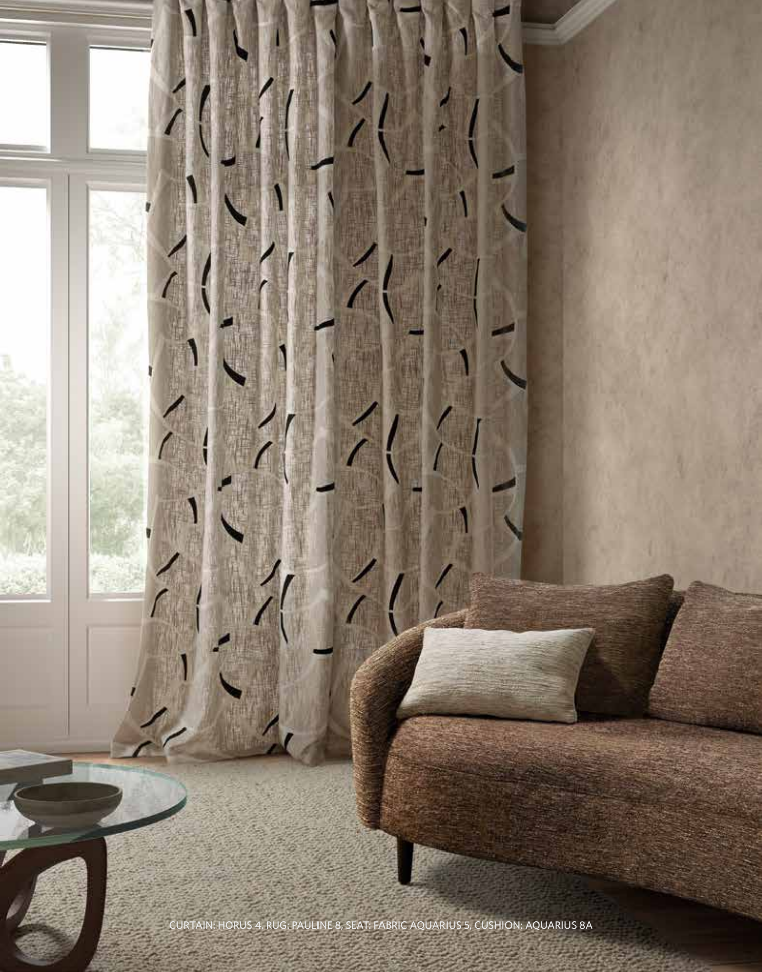
CURTAIN: HORUS 4, RUG: PAULINE 8, SEAT: FABRIC AQUARIUS 5, CUSHION: AQUARIUS 8A