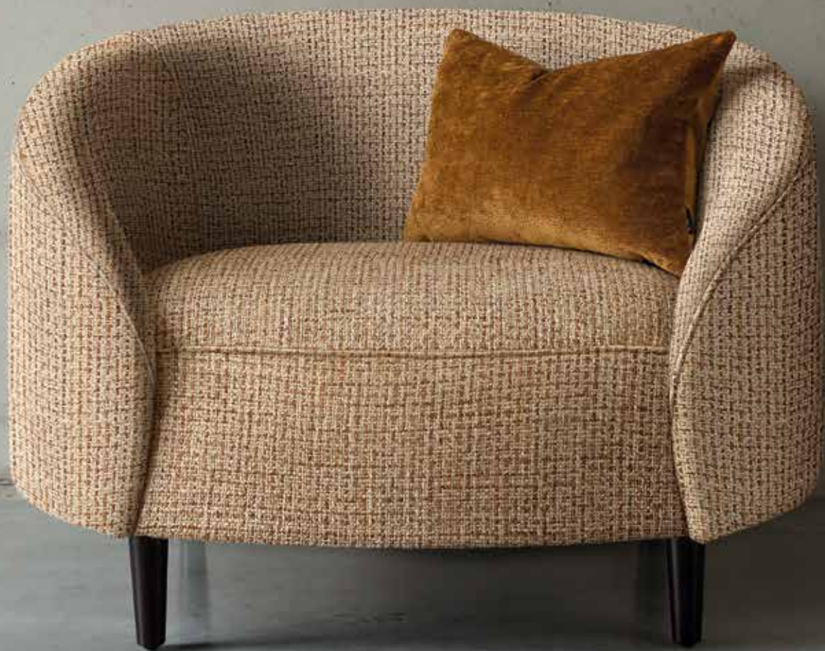
CLUBCHAIR: FABRIC METEOR 16, CUSHION: PRIMUS 2