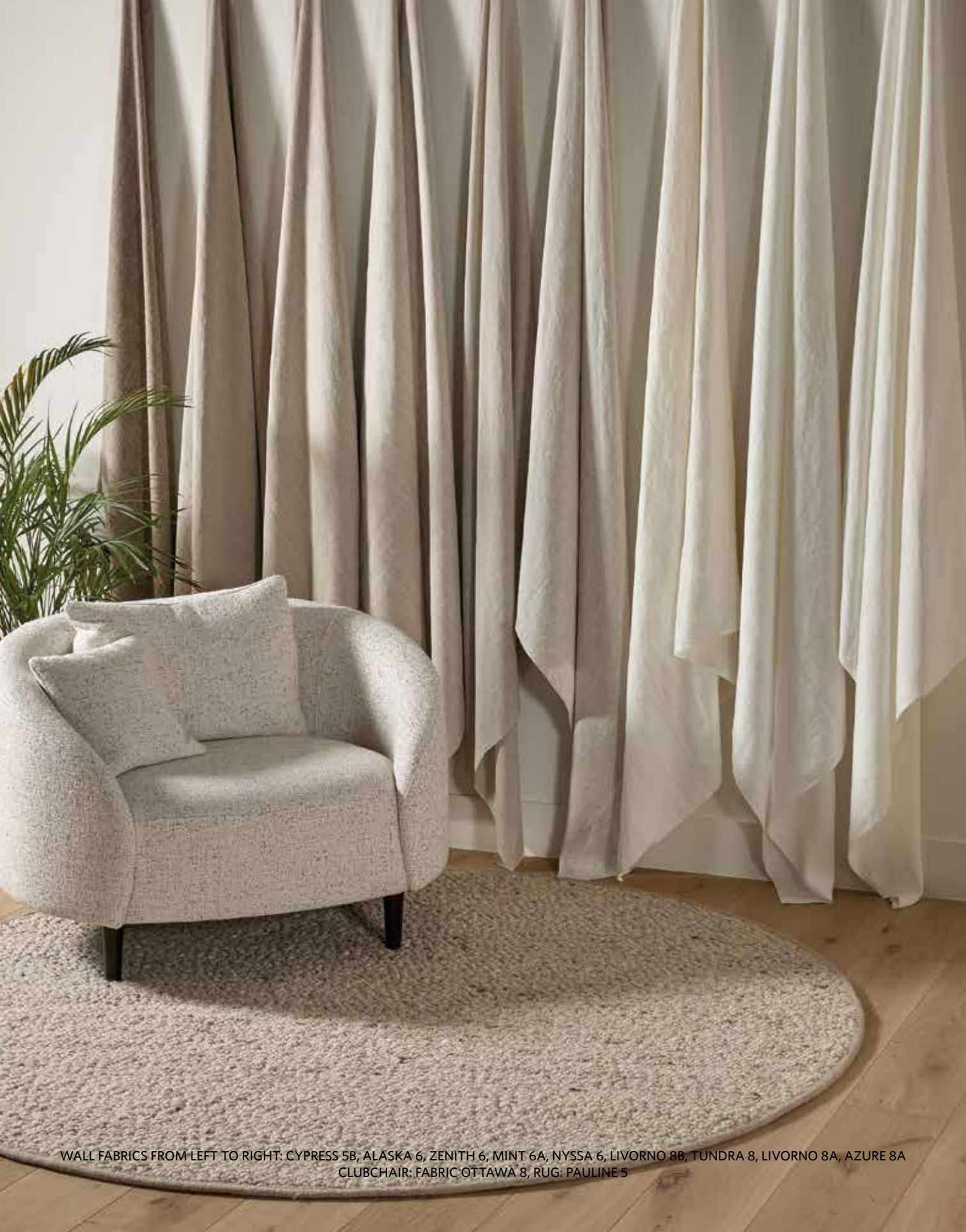
WALL FABRICS FROM LEFT TO RIGHT: CYPRESS 5B, ALASKA 6, ZENITH 6, MINT 6A, NYSSA 6, LIVORNO 8B, TUNDRA 8, LIVORNO 8A, AZURE 8A CLUBCHAIR: FABRIC OTTAWA 8, RUG: PAULINE 5