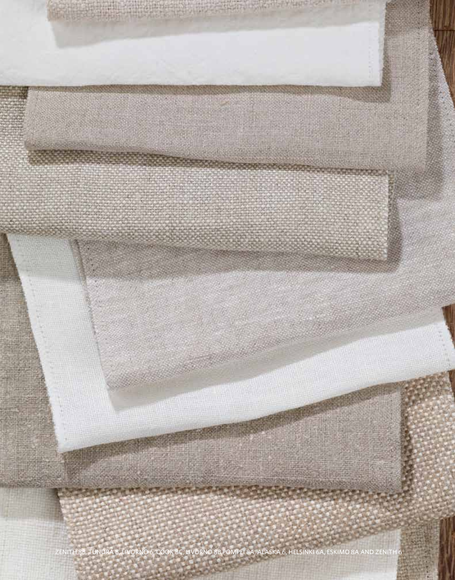
ZENITH 8B, TUNDRA 8, LIVORNO 6, COOK 8C, LIVORNO 8B, POMPEI 8A, ALASKA 6, HELSINKI 6A, ESKIMO 8A AND ZENITH 6