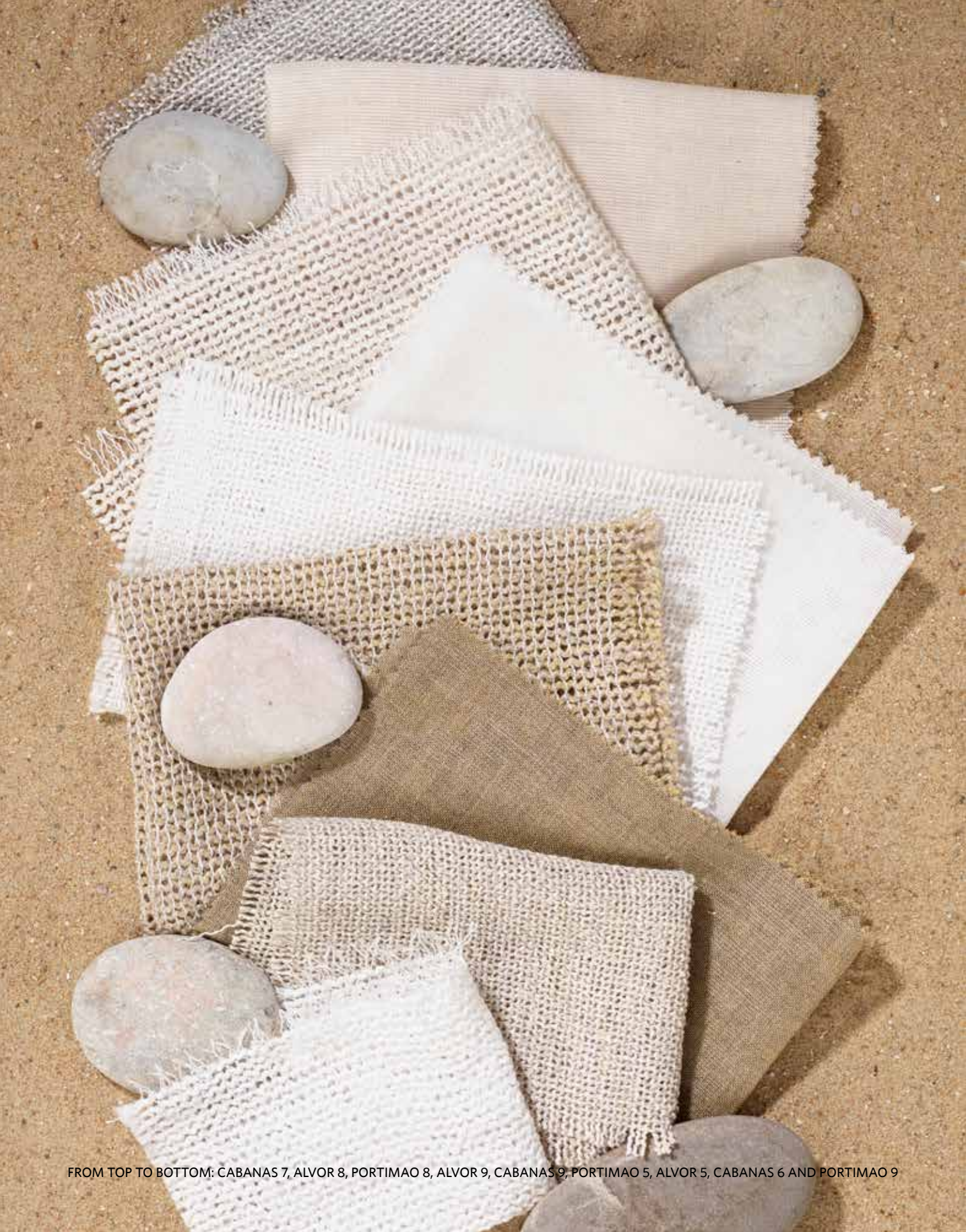
FROM TOP TO BOTTOM: CABANAS 7, ALVOR 8, PORTIMAO 8, ALVOR 9, CABANAS 9, PORTIMAO 5, ALVOR 5, CABANAS 6 AND PORTIMAO 9