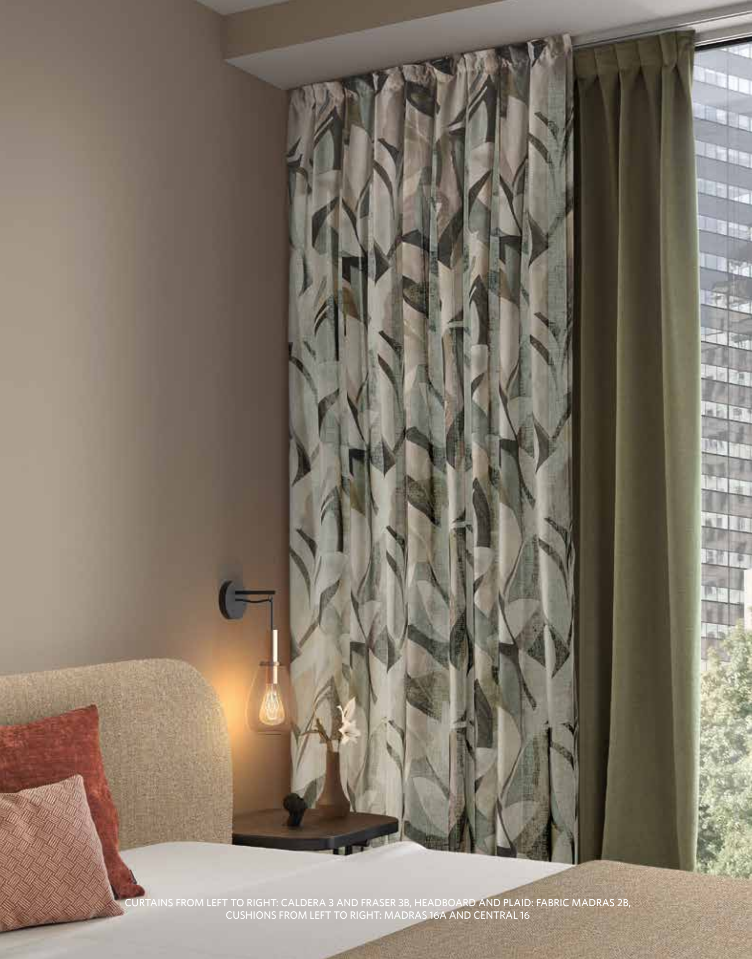
CURTAINS FROM LEFT TO RIGHT: CALDERA 3 AND FRASER 3B, HEADBOARD AND PLAID: FABRIC MADRAS 2B, CUSHIONS FROM LEFT TO RIGHT: MADRAS 16A AND CENTRAL 16