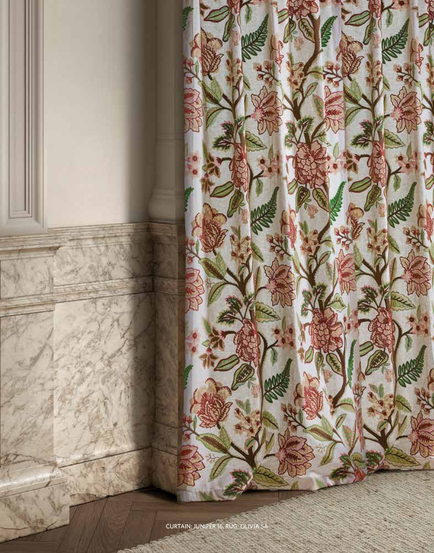
CURTAIN: JUNIPER 16, RUG: OLIVIA 5A