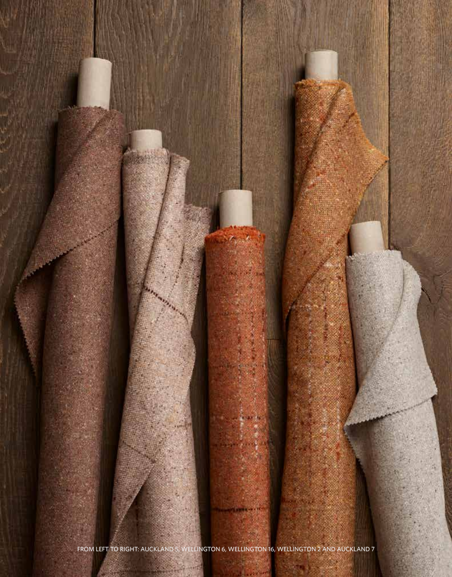
FROM LEFT TO RIGHT: AUCKLAND 5, WELLINGTON 6, WELLINGTON 16, WELLINGTON 2 AND AUCKLAND 7