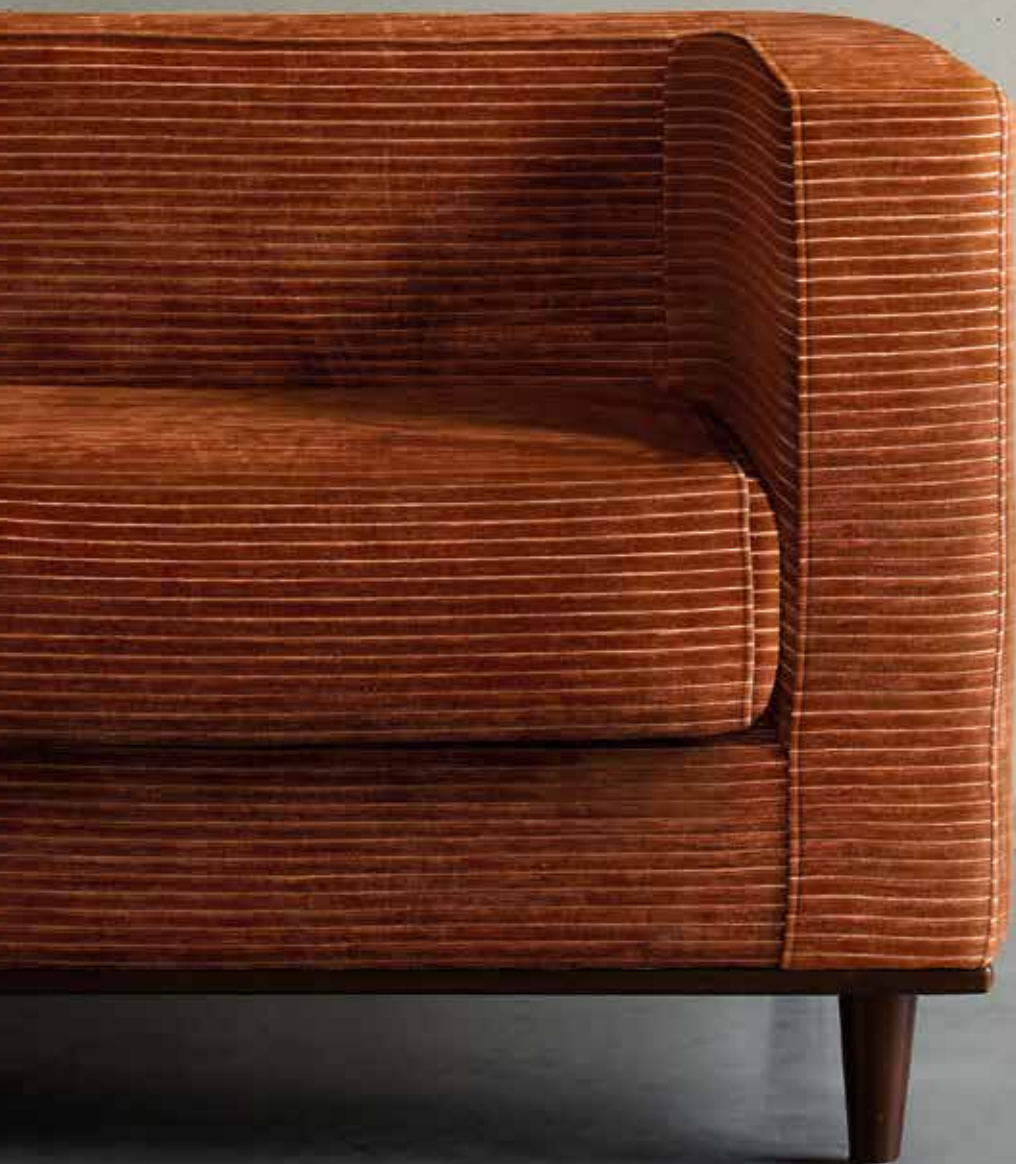
CLUBCHAIR: FABRIC VERITAS 16